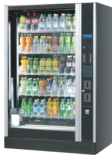
SandenVendo G-Drink vending machine based on SANDEN CO 2 technology

The SANDEN group has developed unique knowledge in CO 2 technology encompassing a large panel of applications. SANDEN manufactures CO 2 heat pump water heaters, vending machines and retail refrigeration systems worldwide.